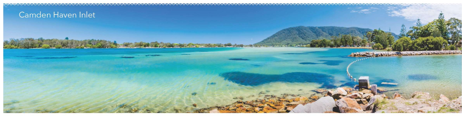
Camden Haven Inlet

For maps of Camden Haven and surrounding areas, please visit Reception