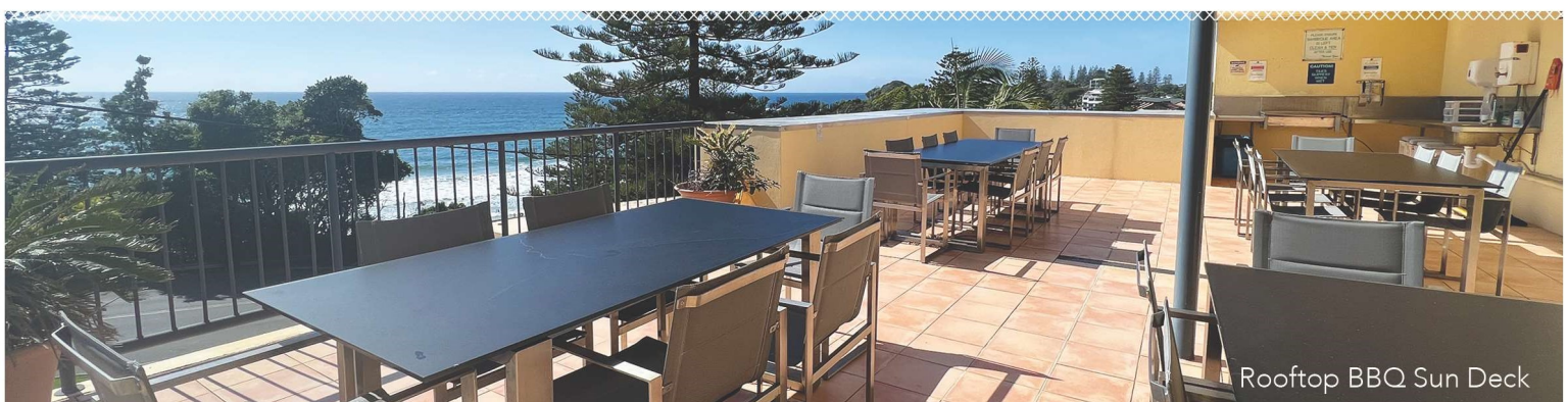
Rooftop BBQ Sun Deck